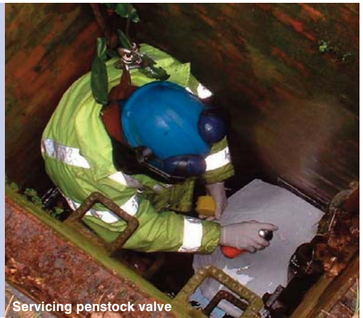
Servicing penstock valve

Specifically designed to satisfy the stringent requirements of Environment Agency/SEPA document PPG3 and European Standard EN858-2, Adler and Allan Separator Services include: