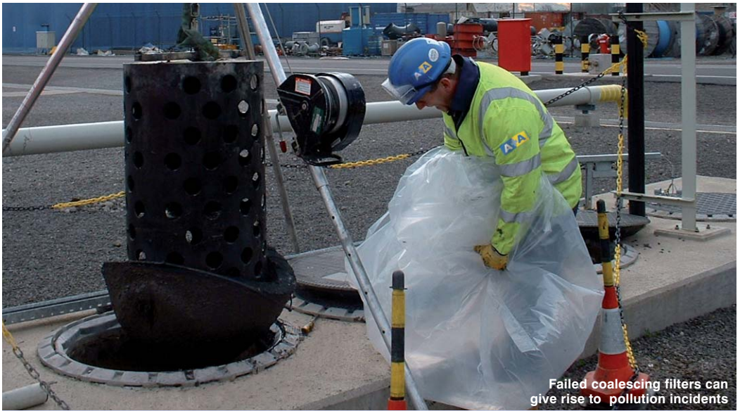
Failed coalescing filters can give rise to pollution incidents

Despite the widespread installation of oil separators (interceptors) in areas of contaminated run-off risk, water courses are still becoming polluted and site owners prosecuted. This can often be attributed to lack of maintenance, faulty parts and on some occasions incorrect installation.