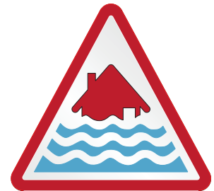
Severe Flood Warning

Flooding is expected. Immediate action required.